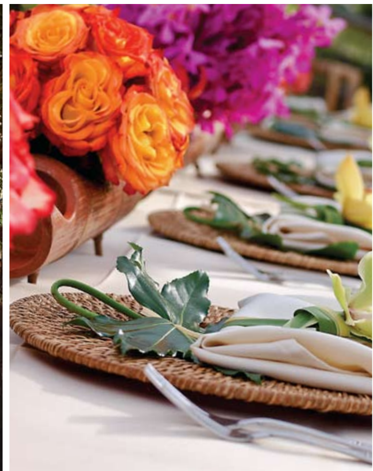
OPPOSITE, CLOCKWISE FROM TOP LEFT: RAINBOW VISIONS PHOTOGRAPHY; BOLONGO BAY; DAVID NOLE; SHANNON GREER